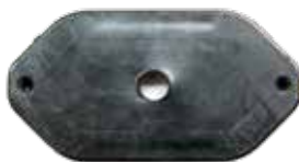
HOLE SAW CENTERING GUIDE