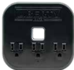
HUB A - INSIDE OUTLET