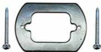
COVER PLATE & COVER PLATE SCREWS (1 3/4")