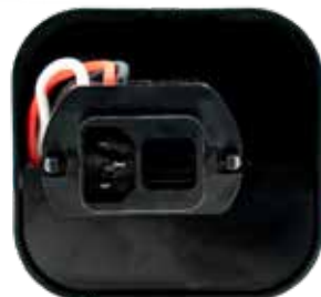
HUB B - OUTSIDE OUTLET